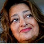
› Zaha Hadid